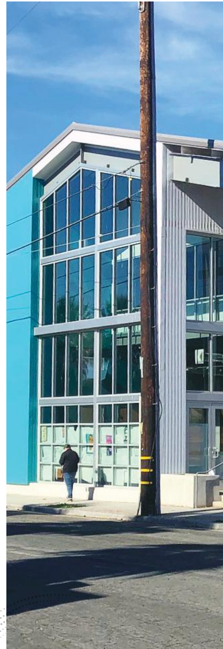
Avcon Constructors, Inc. Richmond, CA